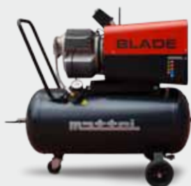
BLADE S 90 Litres