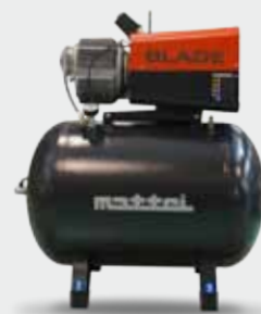
BLADE S 200 Litres